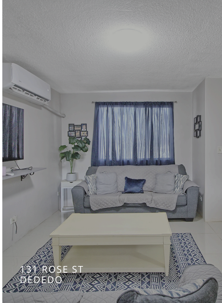
131 ROSE ST DEDEDO