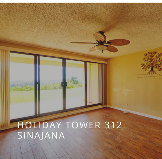
HOLIDAY TOWER 312 SINAJANA