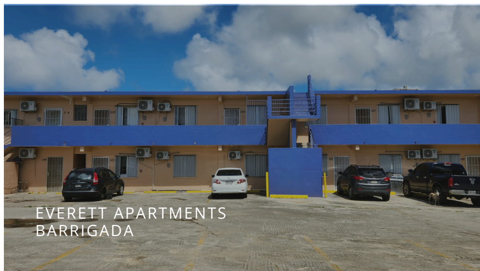
EVERETT APARTMENTS BARRIGADA