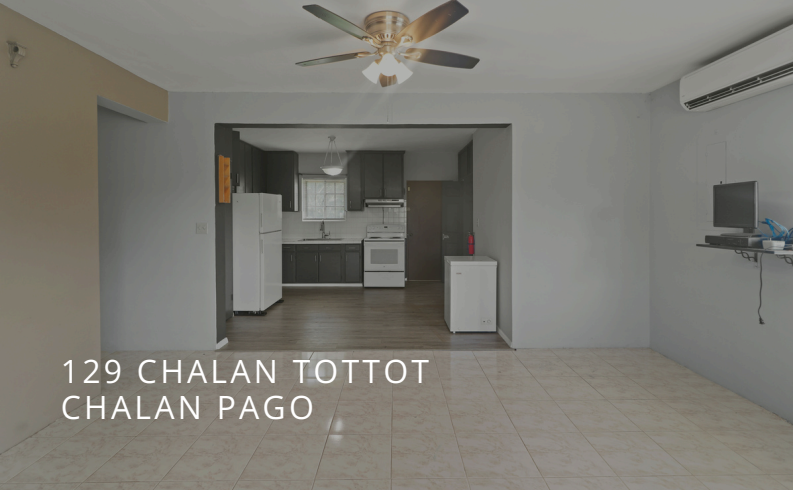
129 CHALAN TOTTOT CHALAN PAGO