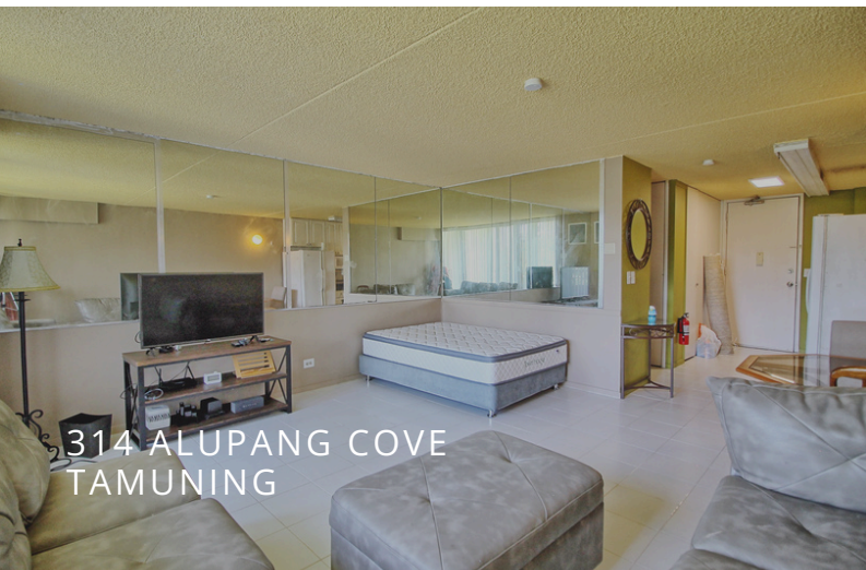
314 ALUPANG COVE TAMUNING