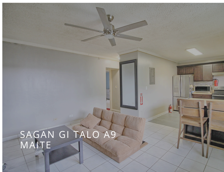
SAGAN GI TALO A9 MAITE